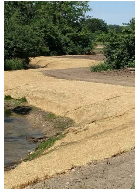
Seeding & straw mat on Greenbriar Ext.