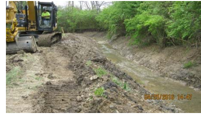
PCE crews cleaning Greenbriar Ext.